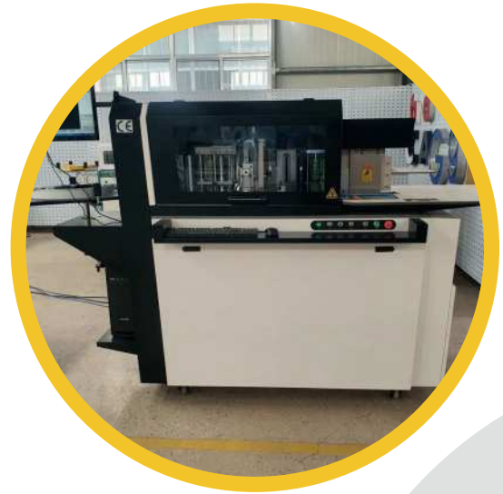
Letter Bending Machine