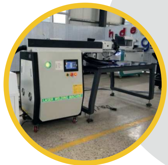
SS Letter Welding Machine