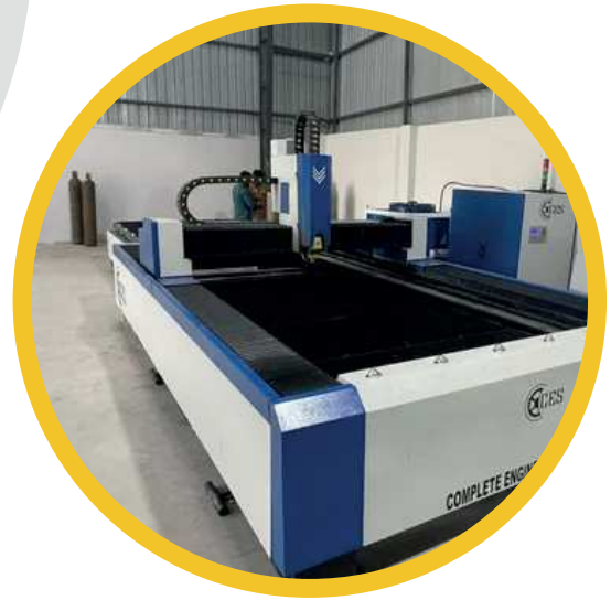
CNC Cutting Machine