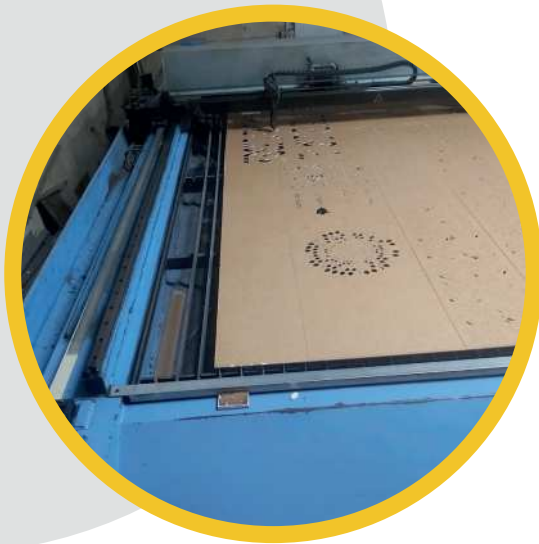
Acrylic Laser Cutting Machine