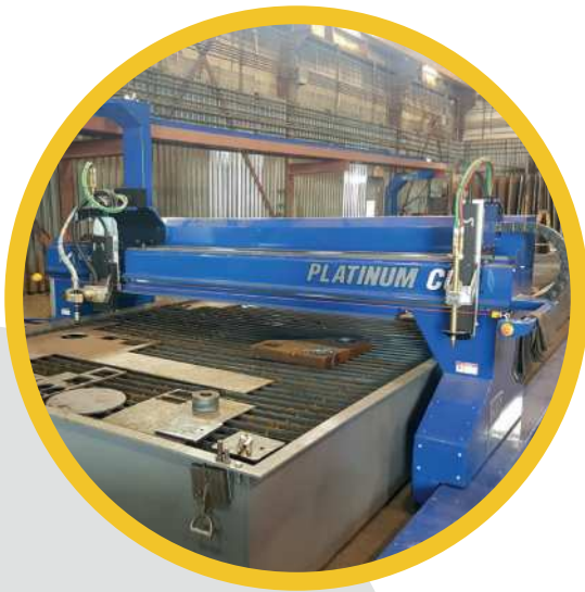
Fiber Laser Cutting Machine